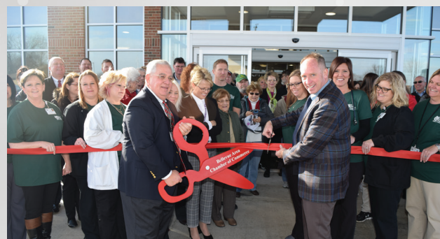
Community members, TBH board members and TBH employees attended the grand opening and ribbon cutting of Eagle Crest Health Park on December 12, 2018.

serves the healthcare needs of residents in the Clyde, Bellevue, Fremont, and surrounding areas.