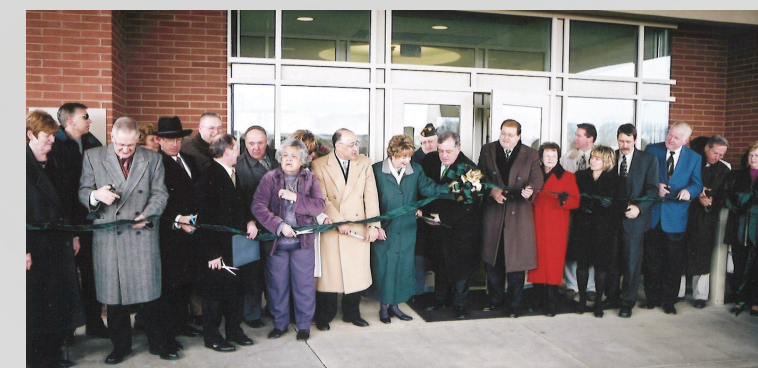
Area leaders and hospital officials cut the ribbon at the opening of The Bellevue Hospital’s newest facility on February 27, 2005.