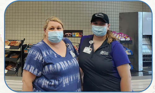
Main Station Café