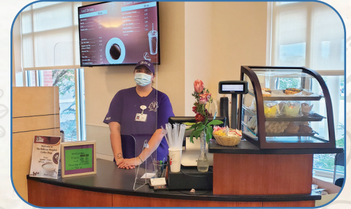
TBH Coffee Shop